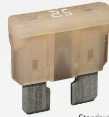
Standard (ATO) Fuse