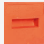
Molded carrying handle