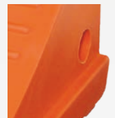
Mounting hole for rope, chains, brackets