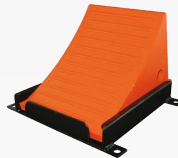
P/N. QVWCBRK005 Wheel chock bracket to suit QVWCHD005 (Optional)